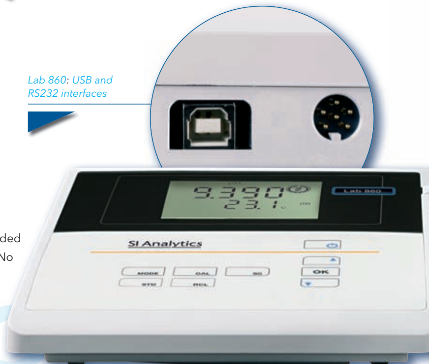
Lab 860: USB and RS232 interfaces